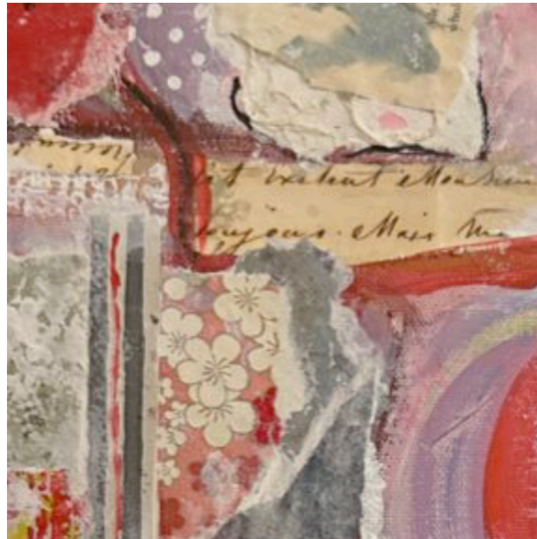
Pink Noise (top detail), 2023, collage and acrylic on canvas, 6" x 12"