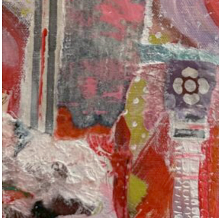
Pink Noise (bottom detail), 2023, collage and acrylic on canvas, 6" x 12"